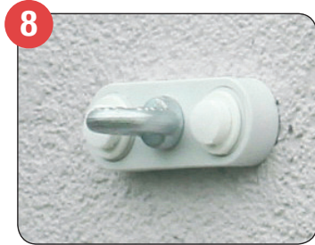
Secured and water tight.