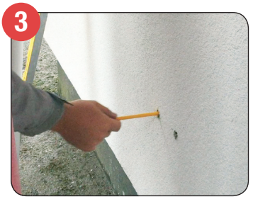
Insert tube, or measure depth of hole from finished render back to the original substrate, making an allowance of 4mm to allow the neoprene washer to compress and provide a seal when installed.