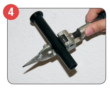
Cut tube to length using pipe cutter ensuring an allowance has been made for the depth.