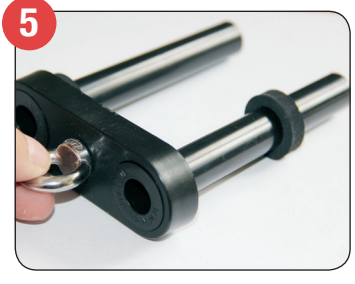
Place neoprene washers on to tubes, connect eyebolt and insert fitting into holes.