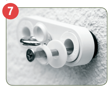
Insert plug, fixing and screw cap ( you may require the use of the plastic washer supplied, dependant on the fixing used).