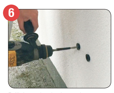
Drill through tube into substrate to the appropriate depth for fixing (site specific).