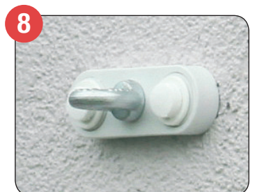
8 Secured and water tight.