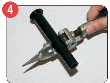
4 Cut tube to length using pipe cutter ensuring an allowance has been made for the depth.