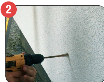
2 Drill a 16mm hole through the render and insulation until the original substrate is reached.