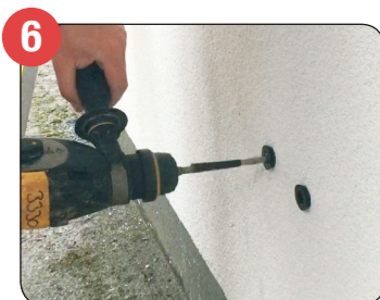
6 Drill through tube into substrate to the appropriate depth for fixing (site specific).