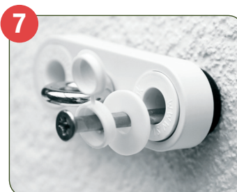
7 Insert plug, fixing and screw cap ( you may require the use of the plastic washer supplied, dependant on the fixing used).