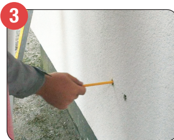
3 Insert tube, or measure depth of hole from finished render back to the original substrate, making an allowance of 4mm to allow the neoprene washer to compress and provide a seal when installed.