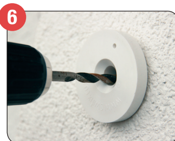
6 Drill through tube into substrate to the appropriate depth for fixing (you may require the use of the washer supplied, dependant on fixing used).