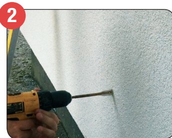
2 Drill a 16mm hole through the render and insulation until the original substrate is reached.