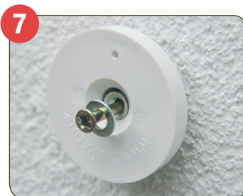
7 Secure and watertight.