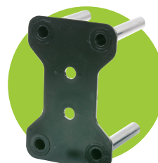
Satellite fitting plate