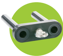
Connection point fitting